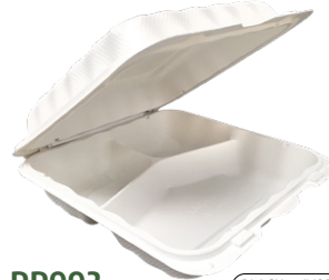
PP993 (BLACK or IVORY)

8.00" X 8.00" X 3.00", 1-COMP, PP Quantity: 150 (1 sleeve of 150 ct) Case Size: 18.50" x 8.25" x 17.00" Case Cube: 1.50 ft 3 Gross Case Weight: 22.00 lbs Ti/Hi: 10 x 4