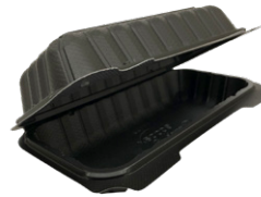
PP622-BK (BLACK only)

7.88" X 8.00" X 2.35", 3-COMP, PP Quantity: 150 (1 sleeve of 150 ct) Case Size: 18.50" x 7.87" x 15.75" Case Cube: 1.33 ft 3 Gross Case Weight: 20.00 lbs Ti/Hi: 12 x 6