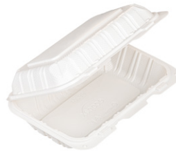
PP204 (IVORY only)

8.13" X 6.5" X 2.63", 1-COMP, PP Quantity: 300 (2 sleeves of 150 ct) Case Size: 19.21" x 16.93" x 13.39" Case Cube: 2.52 ft 3 Gross Case Weight: 29.00 lbs Ti/Hi: 7 x 6