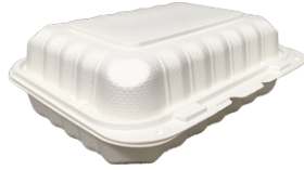
PP203-300 (IVORY only)

7.76" X 5.87" X 2.60", 1-COMP, PP Quantity: 340 (2 sleeves of 170 ct) Case Size: 17.40" x 12.21" x 15.95" Case Cube: 1.96 ft 3 Gross Case Weight: 26.00 lbs Ti/Hi: 8 x 6