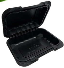
PP201-BK-340 (BLACK only)

Grease Resistant • Durable • Microwaveable • Reduce Plastic Usage • Reusable • BPA & PFAS Free