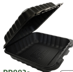
PP883s (BLACK or IVORY)

8.00" X 8.00" X 3.00", 3-COMP, PP Quantity: 150 (1 sleeve of 150 ct) Case Size: 18.50" x 8.25" x 17.00" Case Cube: 1.50 ft 3 Gross Case Weight: 22.00 lbs Ti/Hi: 10 x 4