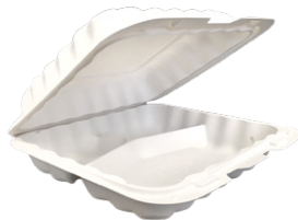
PPs241 (IVORY only)

7.88" X 8.00" X 2.50", 3-COMP, PP Quantity: 150 (1 sleeve of 150 ct) Case Size: 18.50" x 7.87" x 15.75" Case Cube: 1.33 ft 3 Gross Case Weight: 19.51 lbs Ti/Hi: 12 x 6