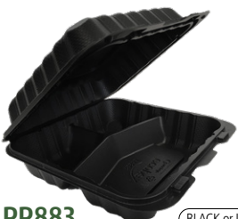
PP883 (BLACK or IVORY)

13.23" X 4.72" X 3.31" HOAGIE CONTAINER, NON-VENTED, PP Quantity: 150 (1 sleeve of 150 ct) Case Size: 18.5" x 10.28" x 13.62" Case Cube: 1.50 ft 3 Gross Case Weight: 19.53 lbs Ti/Hi: 10 x 7