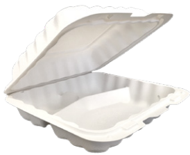
PP241 (IVORY only)

9.25" X 6.50" X 2.25", 1-COMP, PP Quantity: 150 (1 sleeve of 150 ct) Case Size: 18.50" x 9.45" x 13.39" Case Cube: 1.35 ft 3 Gross Case Weight: 18.00 lbs Ti/Hi: 10 x 7