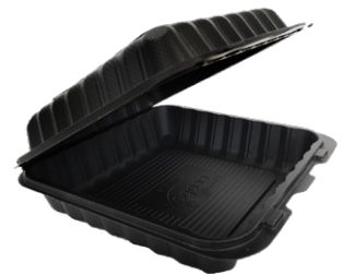
PP993s (BLACK or IVORY)

9.13" X 8.81" X 3.00", 3-COMP, PP Quantity: 150 (1 sleeve of 150 ct) Case Size: 20.50" x 9.00" x 18.50" Case Cube: 1.98 ft 3 Gross Case Weight: 28.00 lbs Ti/Hi: 10 x 5