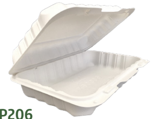
PP206 PP206-BK (BLACK or IVORY)

8.86" X 5.86" X 2.79", 1-COMP, PP Quantity: 150 (1 sleeve of 150 ct) Case Size: 18.82" x 9.09" x 12.09" Case Cube: 1.97 ft 3 Gross Case Weight: 15.00 lbs Ti/Hi: 10 x 7