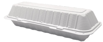
PP1243 (IVORY only)

7.44" X 3.50" X 2.19" SMALL HOT DOG CONTAINER, 1 COMP, PP, HINGE CONTAINER Quantity: 300 (2 sleeves of 150 ct) Case Size: 19.02" x 8.50" x 14.02" Case Cube: 1.32 ft 3 Gross Case Weight: 13.00 lbs Ti/Hi: 10 x 6