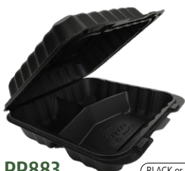
PP883 (BLACK or IVORY)

13.23" X 4.72" X 3.31" HOAGIE CONTAINER, NON-VENTED, PP Quantity: 150 (1 sleeve of 150 ct) Case Size: 18.5" x 10.28" x 13.62" Case Cube: 1.50 ft 3 Gross Case Weight: 19.53 lbs Ti/Hi: 10 x 7