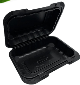
PP201-BK-340 (BLACK only)

Grease Resistant • Durable • Microwaveable • Reduce Plastic Usage • Reusable • BPA & PFAS Free