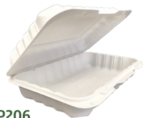
PP206 PP206-BK (BLACK or IVORY)

8.86" X 5.86" X 2.79", 1-COMP, PP Quantity: 150 (1 sleeve of 150 ct) Case Size: 18.82" x 9.09" x 12.09" Case Cube: 1.97 ft 3 Gross Case Weight: 15.00 lbs Ti/Hi: 10 x 7